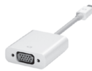
[e.g output cables]